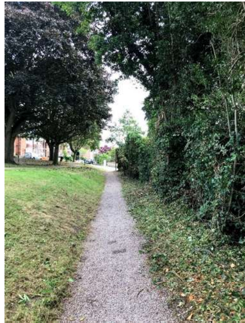
Cleared Sept 2021

The upgrading of this path has been a project for Barrow in Bloom since 2019. In November 2019 Tarmac, A & V Squires and volunteers got together for the first stage to clear the old muddy path and lay a new gravel surface.