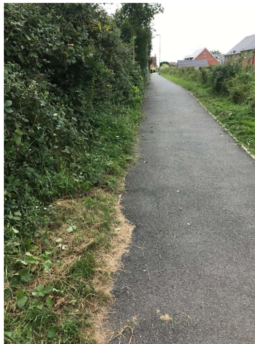
Trimmed and cleared of overgrowing bramble

The area at the end of the path from Buttermere way to Strancliffe Lane was the last part of our task today. Lots of brambles already heavily encroaching onto the path despite our best efforts last year to get it under control. It's not the right time of the year to cut it back too much as the fruit is just ripening so it was another tidy up and trim to keep the overgrowth under control so small children and those using pushchairs and bicycles can get past safely.