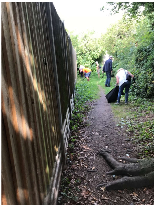
The litter bag already getting full