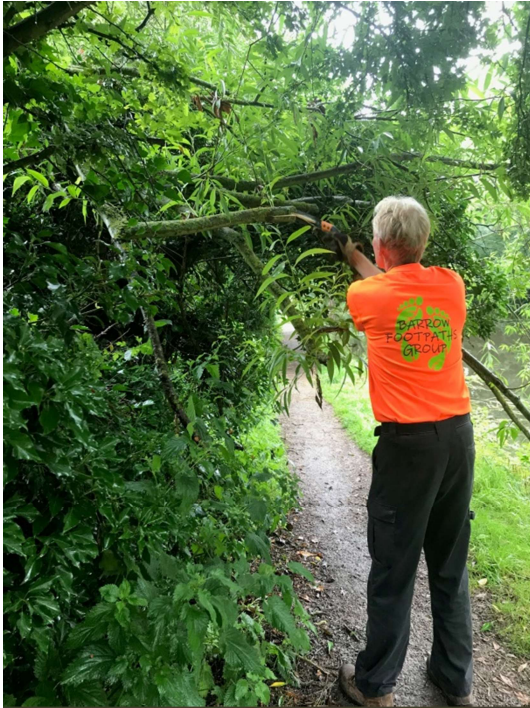
During: Branches across the towpath being cut back