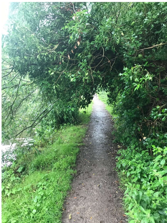
Before: Branches heavy and low over the towpath

The towpath between the Navigation pub and Deep Lock hasn't been done for almost a year and you could tell especially with the earlier rain making the tree branches heavy and weighted down. In one area it seemed almost like a limbo challenge to get under.