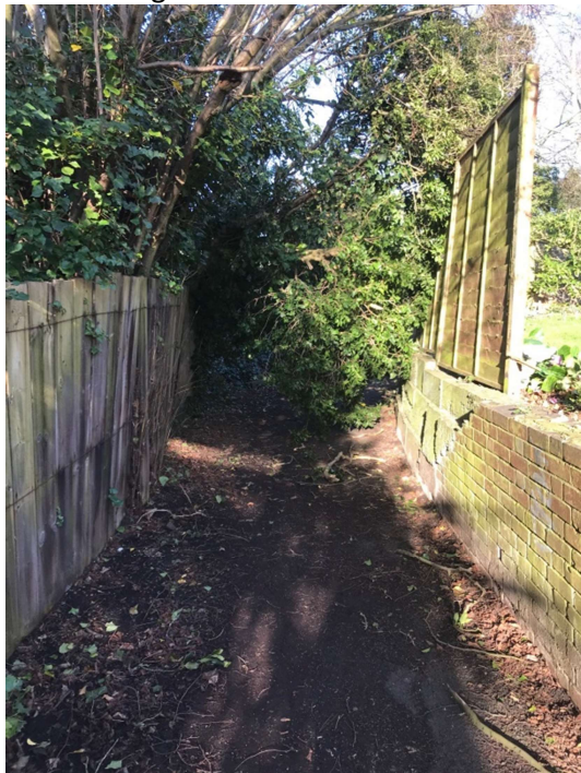
The path well and truly blocked as we arrived

We had another set of brown bins organised by the Parish council and provided by Charnwood Borough Council to fill and soon started the clear up. In no time it was cleared as much as we could without having the benefit of a chainsaw.