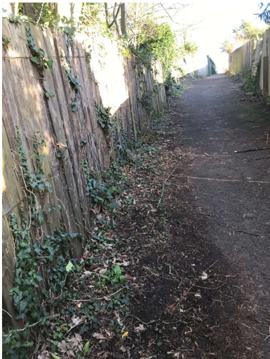
Looking up the jitty towards the railway bridge – leaf debris over large parts of the path

We also cleared the jitty up towards the railway bridge. Again it was mostly cutting back some ivy, some roots and some leaf debris. We have cleared this path a number of times and we always have lots of leaf debris to remove.