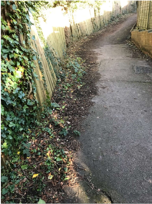
Middle of the path before the clear up.