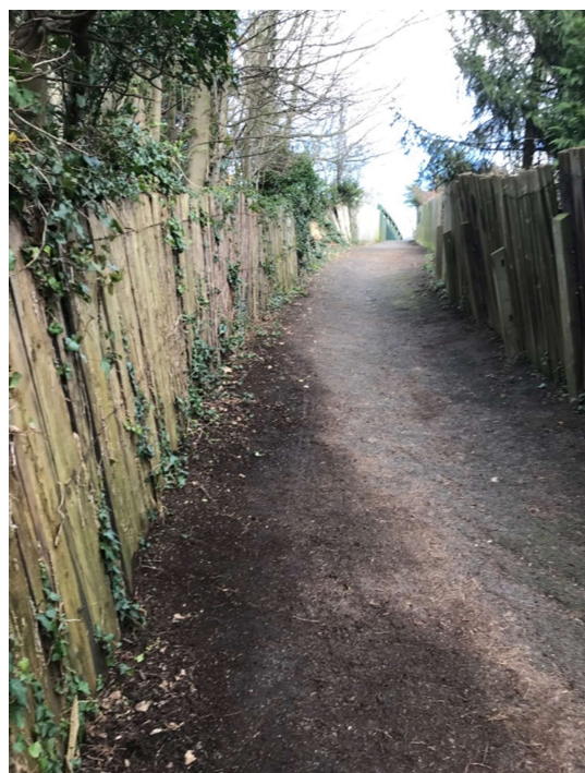
After the clear up – as much leaf debris removed as possible – should be a bit less slippery