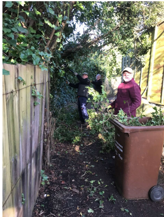
Our Team hard at it!