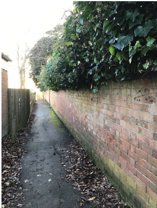
Looking towards Railway - before