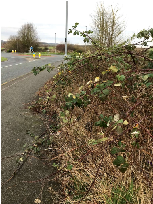
Before photo showing how dense and tall the brambles were becoming

As you can imagine there was also a substantial amount of litter within the mass of bramble and a fairly large collection of bottles soon emerged, including one bottle that was still full, but no takers today!