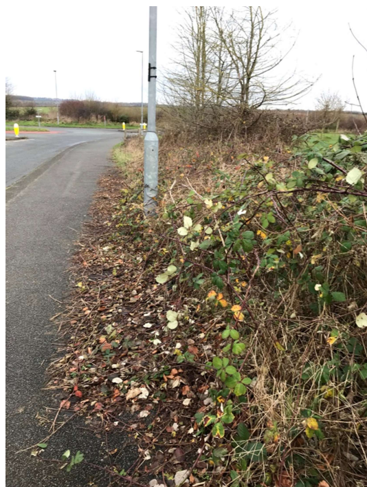
The pavement was slowly getting covered with all the lateral bramble shoots