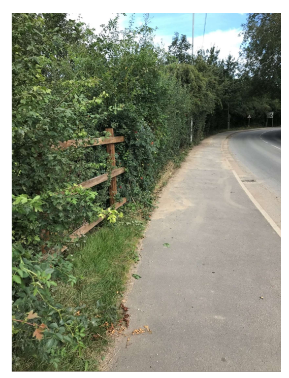
Looking up Melton Road from Poppyfields roundabout. Before the task the hedges were getting overgrown and beginning to obstruct the pavements. We cut back along the nearside edge of the pavements and right back into the hedge where possible.