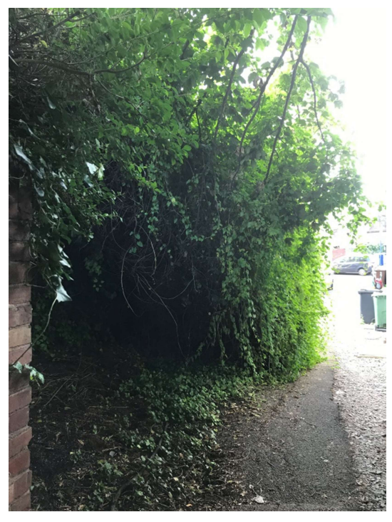
Looking down the path - Before