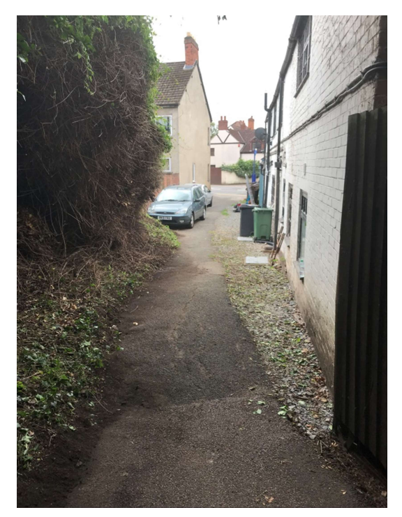
Looking down the path - After