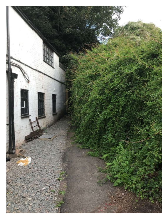
Looking up the path - Before

Thanks to the Parish Council for organising 6 brown bins from Charnwood Borough Council for the green waste to be collected and taken away.