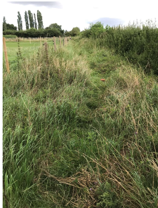
Looking towards Seagrave – clear path after