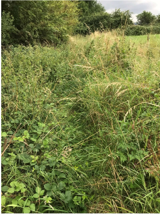
Path looking back towards Barrow - before, lots of overgrowth