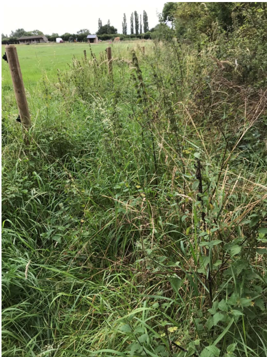
Looking towards Seagrave - path before full of nettles

It takes about 20 minutes from Melton Road to walk along to this overgrown section. Fairly impassable before we started but now easy to walk along. You could see where we had cut back the bramble earlier in the year. We also cleared the many styles along the way of summer overgrowth.