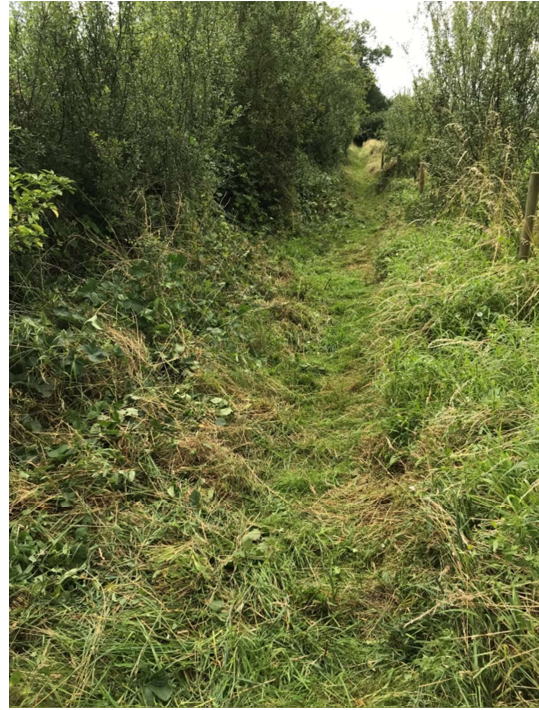
Path looking back towards Barrow - after, clear of nettles, bramble