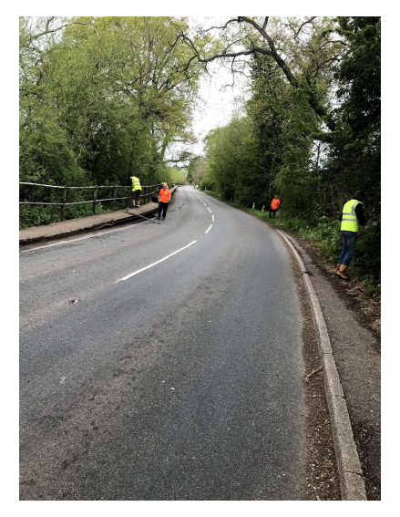
Teams spread out to keep in line with social distancing guidelines.

Splitting up into small teams or either 2, 3 or 4, to comply with CV19 restrictions, we all made our way up Barrow Road before branching off at intervals of approx 200m to start heading back towards Barrow. All in our flattering Hi-Vis tops to make ourselves as visible as possible and off we went.