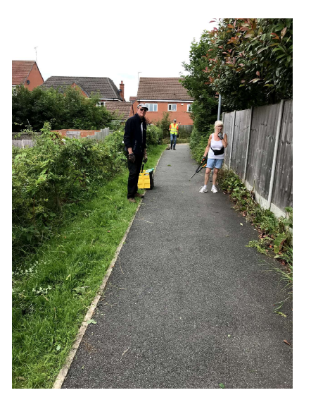
Next Task: Thursday 22<sup>nd</sup> July 10:00 am Location: Navigation Inn

Nick also took the top of the nettles off on the path down between the estate and Humphrey Perkins school that we started 2 weeks ago – all clear again for a few weeks!