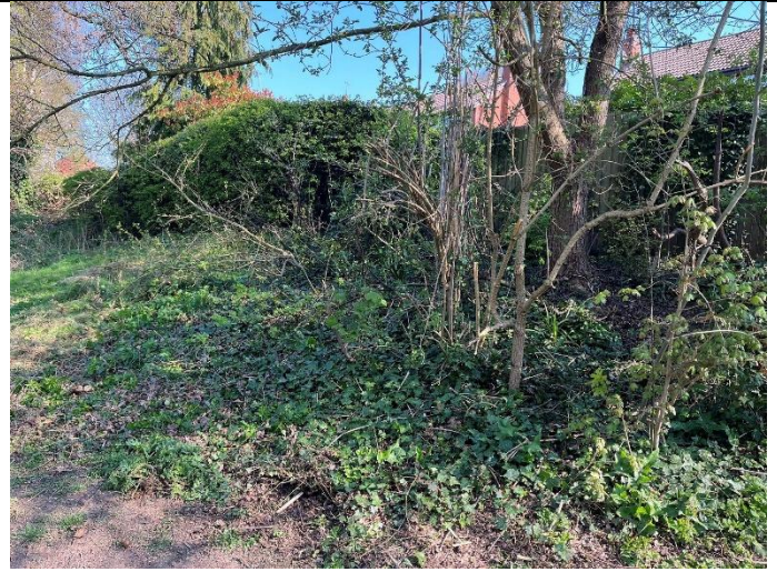
The copse - cleared of the addition dumped trees