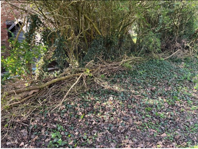
The dead hedge area