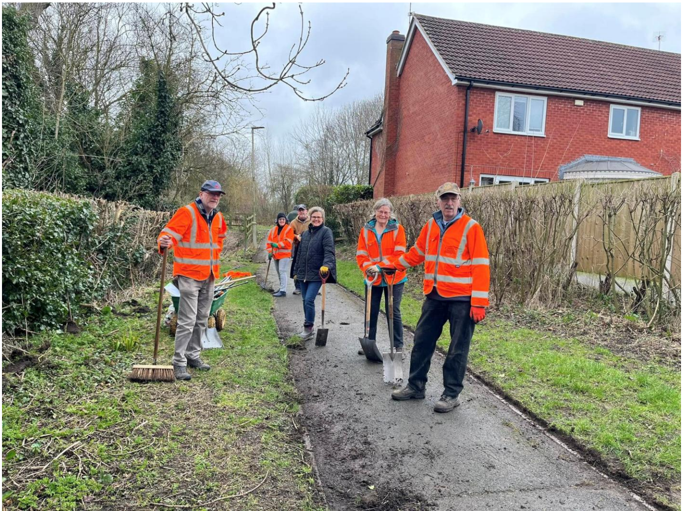
At the start of- and still full of energy