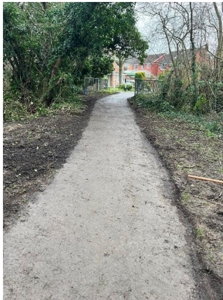
Looking towards Heron Road