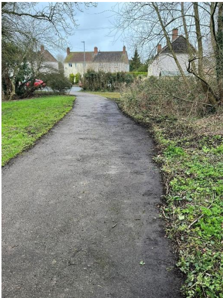
Bottom of Brook Lane - much wider now