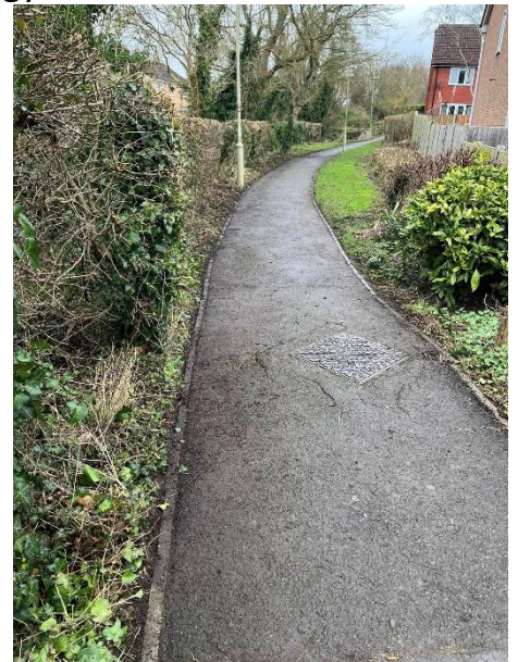
Looking towards Fishpool Way