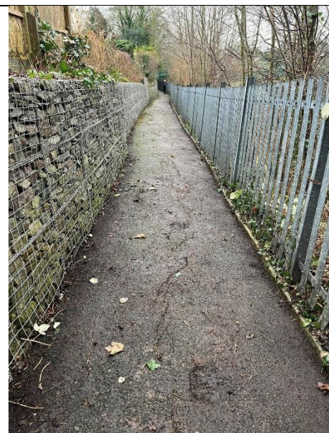
Looking down from the cobble wall