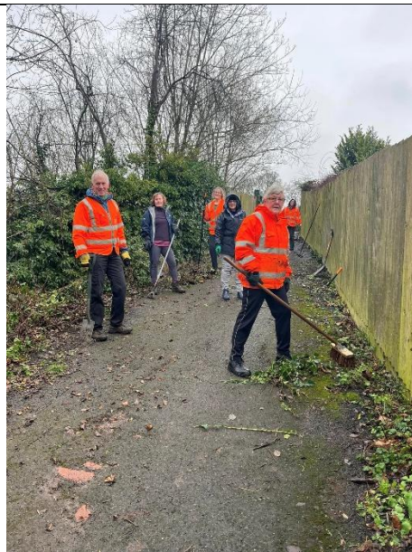
Top of the jitty