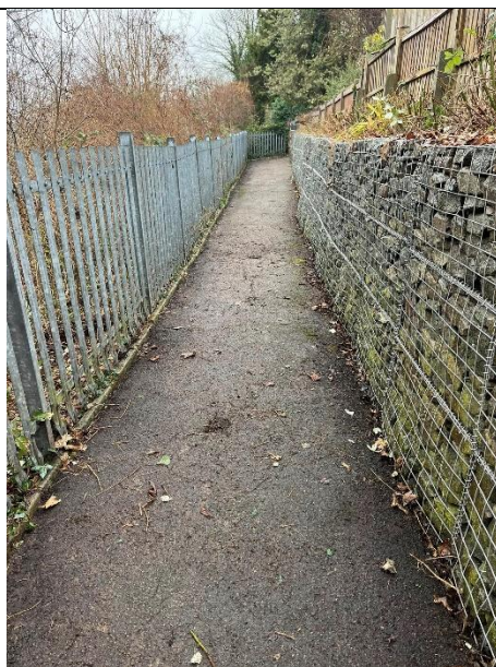
Looking up from the cobble wall