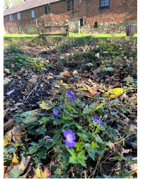
Looking forward to seeing the Daffs flower in spring