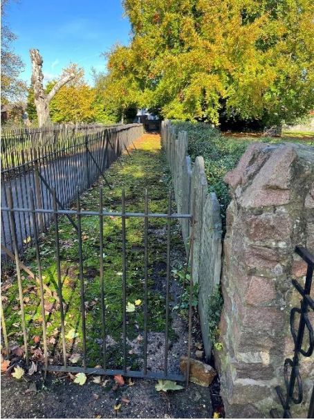
Nicely cleared and trimmed