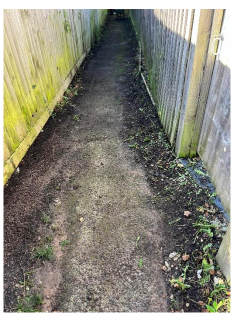
Entrance at the Sileby Road end leading to Avon Road - weeds and bindweed all removed